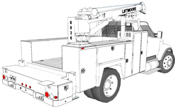
DHD 84 72K CB with O/A and Tailshelf Option

Our Promise To You: " No Compromise" in Providing the Very Best Equipment Available!